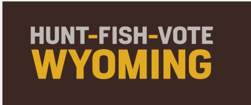
Hunt-Fish-Vote Wyoming is an educational voting resource for Wyoming hunters and anglers. This platform will not be used to support, endorse, or oppose any candidate or political party.